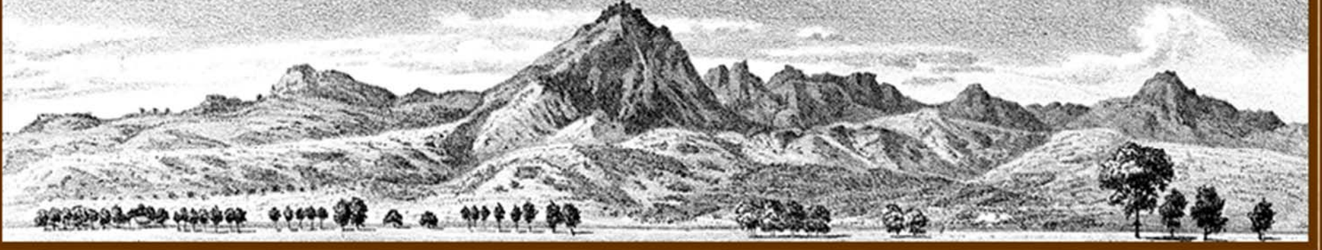
From Thompson & West History of Sutter County 1879