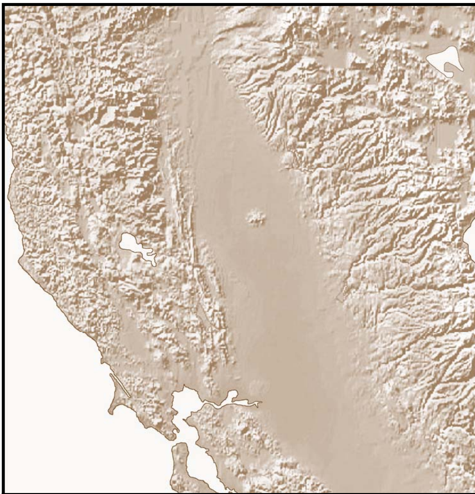
The Sutter Buttes, an extinct volcanic structure, is a distinct feature in the middle of Sacramento Valley of California. It is also the heart of our organization and the middle of our sphere of influence—Sutter, Yuba, and Colusa counties.

In late 1996, McClatchy Newspapers, Inc., donated 200 acres of land in the Sutter Buttes to the Middle Mountain Foundation, bringing it into its full development as a land trust