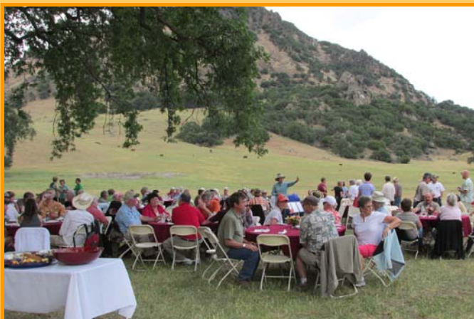
Sunset Serenade May 2013

or 530-671-6116. Details will be sent to you when you register. Sorry, there is no member discount for this event.