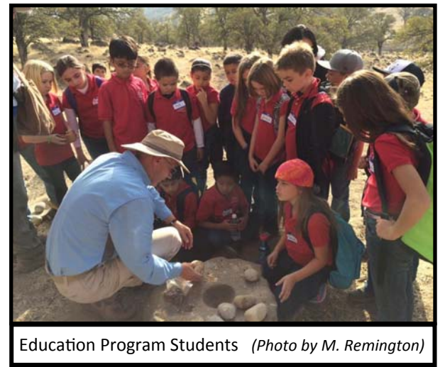
Education Program Students