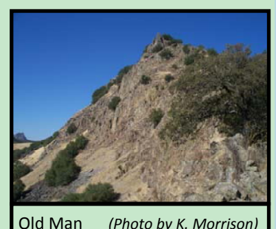
Old Man

Note: Guides do not carry change. If you have made arrangements to pay the day of the outing, do so with a check or money order made out to the Sutter Buttes Regional Land Trust (or SBRLT).