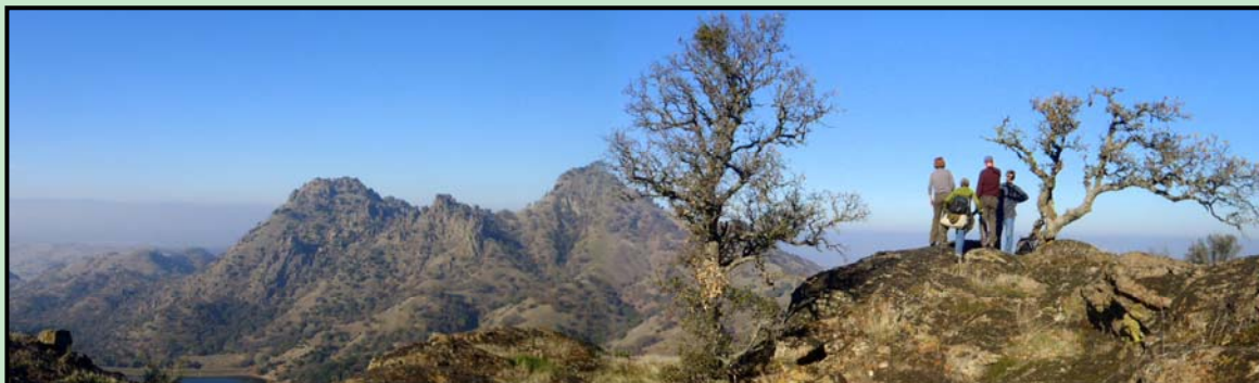
Above Bragg Canyon

Sutter Buttes Calendars, Books, and other items, as well as hiking sticks, are available for sale at the Museum.